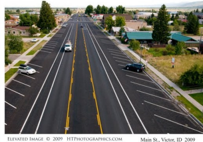
ELEVATED IMAGE Main St., Victor, ID 2009