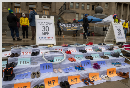
We partnered with IWBA on a World Day of Remembrance demonstration at the Capitol.