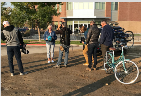
A behind the scenes look at a safety education video shoot with ITD's Office of Highway Safety.