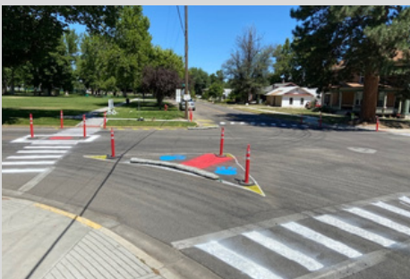
We partnered with the City of Emmett and SW District Health on an education demonstration to reduce speeding through roadway design.